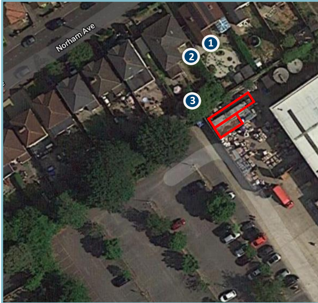
Figure C-1 Measurement Location Plan